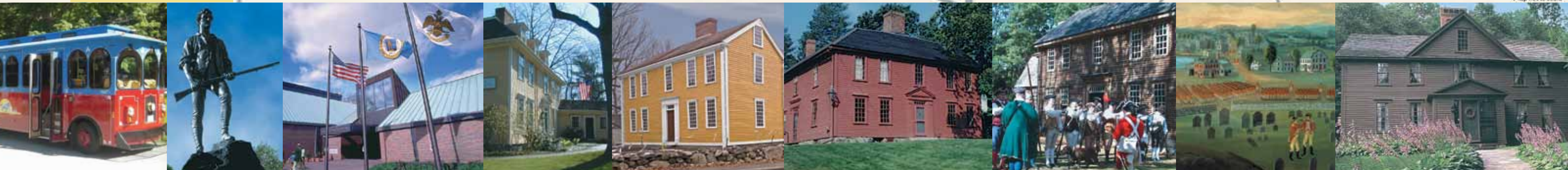
Liberty Ride Trolley Minute Man Statue Museum & Library Buckman Tavern Hancock-Clarke House Munroe Tavern Hartwell Tavern Concord Museum Orchard House—Home of the Alcotts